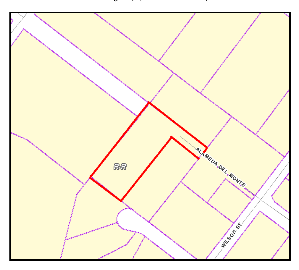
Zoning Map (Rural Residential)

General Plan Map (Estate Density Residential)